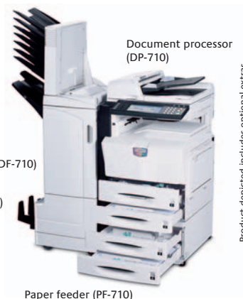
Paper feeder (PF-710)

Product depicted includes optional extras