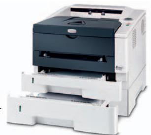
PF-100 Paper feeder

Product depicted includes optional extras